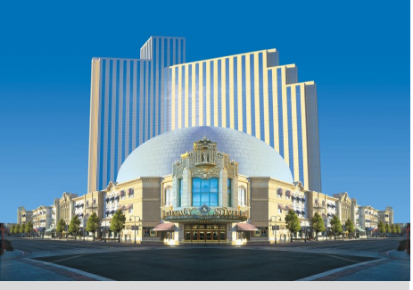
June 2 — June 8, 2018