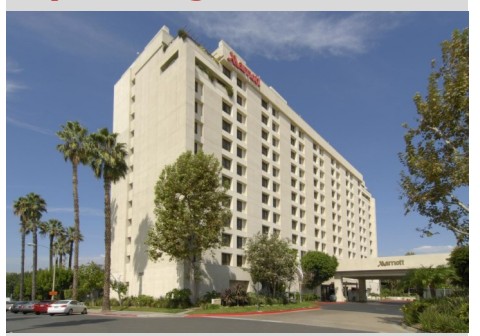
October 8–13, 2017 Marriott Convention Center Riverside, CA